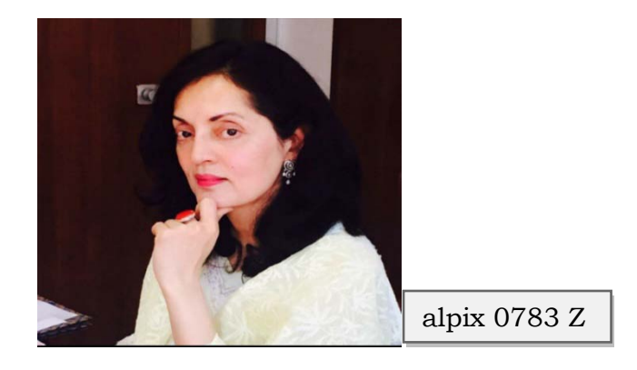
Ruchira Kamboj IFS 1987 B A Eco Hons UPSC women's Topper

From 2011-2014, she was India's Chief of Protocol , the first and only lady so far in Government to have held this position. In this capacity, she directed all outgoing visits of the President of India, the Vice President, the Prime Minister and the External Affairs Minister of India.